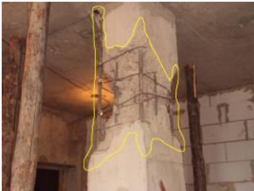
Figure 1 – Column concrete failure with bare and corroded reinforcement

In view of the relevance of the use of concrete mortars for the repair of concrete and reinforced concrete structures, the works and research work of many researchers have been studied. Since concrete on coarse aggregate is not quite acceptable for its application in thin layers, it was decided to use crushed stone of 5...10 mm size as an aggregate. The concrete obtained on such aggregate is classified as fine-grained concrete.