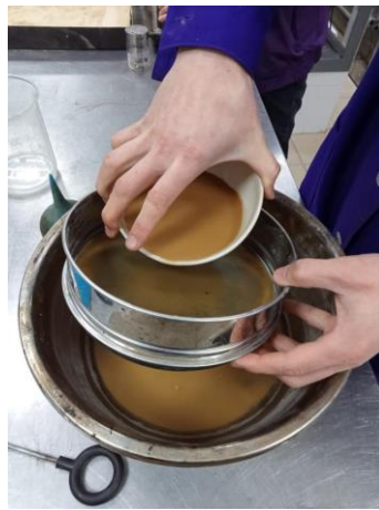
Figure 2 – Washing mineral powder through a 0.063 mm sieve

The results of the study of the grain composition of the selected mineral powders will allow an objective assessment of the quality of the structure of the materials [15]. During the test, selected dried samples of mineral powders are poured with a small amount of water and rubbed for up to 2 minutes. The essence of the experiment is the distribution and separation of grains of mineral powder samples by sieving through sieves and determining the residues on each sieve (Figure 2).