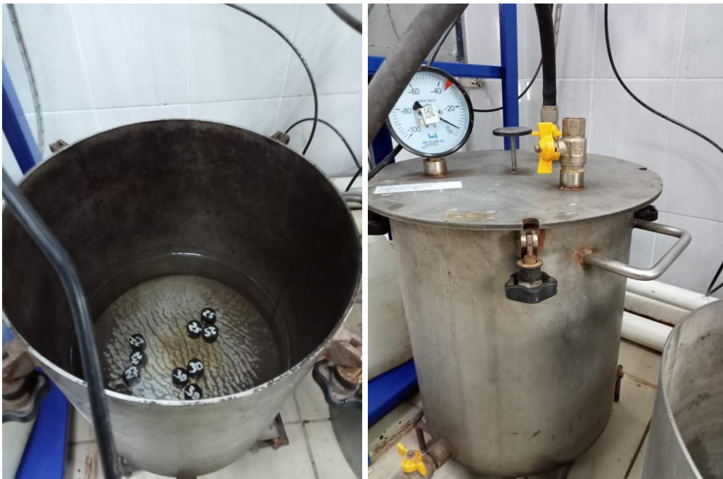
Figure 4 – Determination of swelling of the mixture with bitumen

The essence of the method is to determine the volume increment of samples with water saturation from 4 % to 5 % by volume from the mixture of powder with bitumen after saturation with water under vacuum conditions and subsequent incubation in hot water (Figure 4).