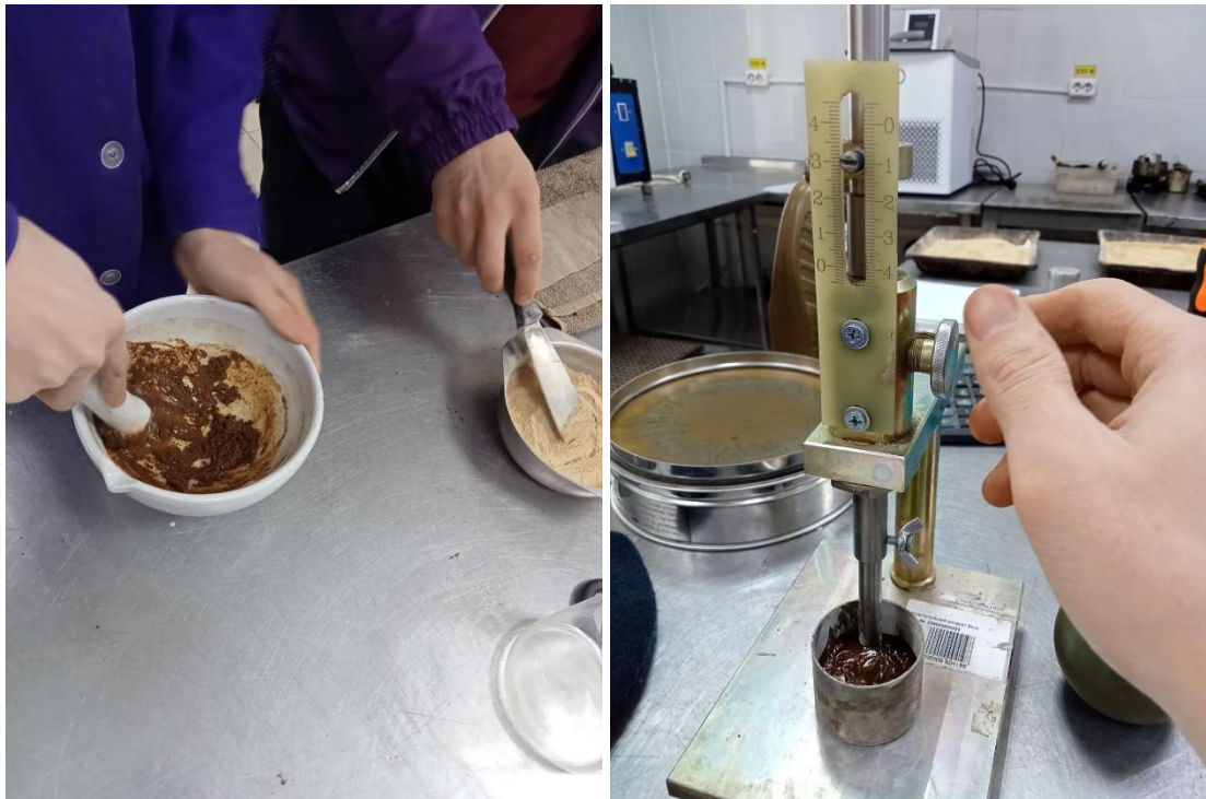
Figure 5 – Determination of bitumen capacity