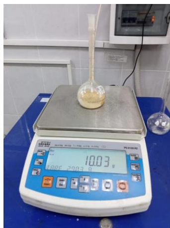
Figure 3 – Determination of sample weight after drying

The essence of the method is to determine the moisture content in the powder (Figure 3).